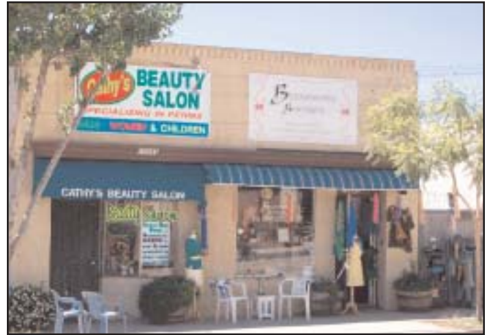
10039 and 41 Commerce – Cathy's Beauty Salon and Bernadette's Boutique