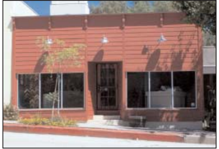
10064 Commerce – American Art, Inc. Oldest Building on Commerce Avenue. Built in 1912. Original Haines Canyon Water Co.