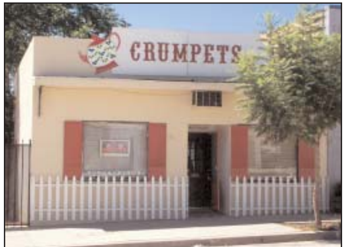
10031 Commerce – Crumpets