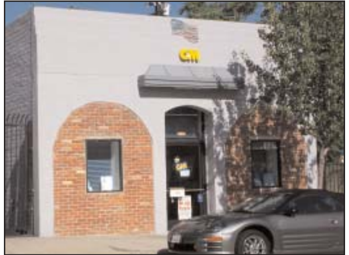
10034 Commerce – C&M