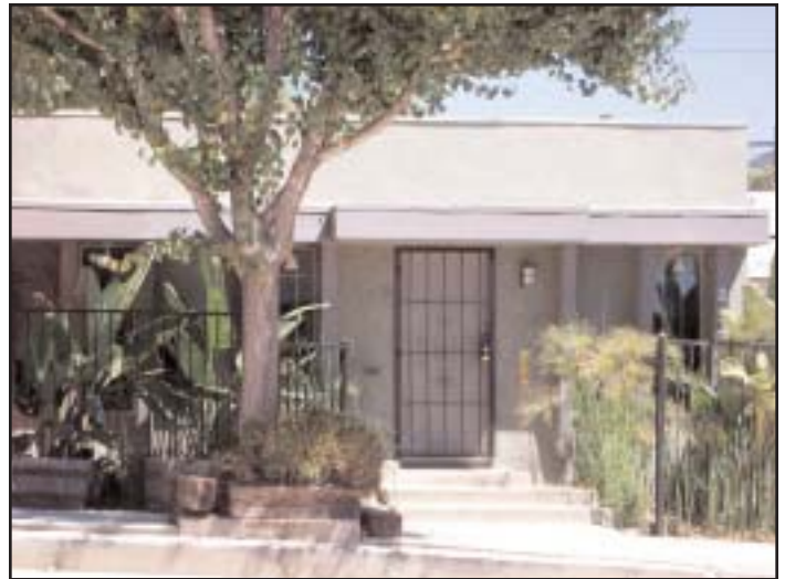
10062 Commerce – J.B. Insurance