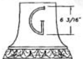
DOOR DETAIL W/ CAST "G" "G" PROJECTS 3/16" ABOVE DOOR SURFACE SCALE: 1/8 SIZE

MATERIAL SPECIFICATIONS MONOTUBE: CHEM & PHYSICAL PROPERTIES OF A585 GRA PLATE, BAR: ASTM A36 ANCHOR BOLTS: ASTM A307 FULL GALV ANCHOR BOLT NUTS: ASTM A563 GR. A GALV. TO A153 MISC. HDWE: (STN. STL) AISI 300 SERIES (18-8) MISC. HDWE: (STEEL) ASTM A307 H.D. GALV TO ASTM A153 ARM CASTING: CAST ALUMINUM A356-7B ORNAMENTAL BASE: CAST ALUMINUM A319-D H.M. FRAME: ASTM-A36 M0050 H.M. COVER: C1010 STL STEEL PIPE: ASTM A501 FINISH PAINT: PER SALES ORDER