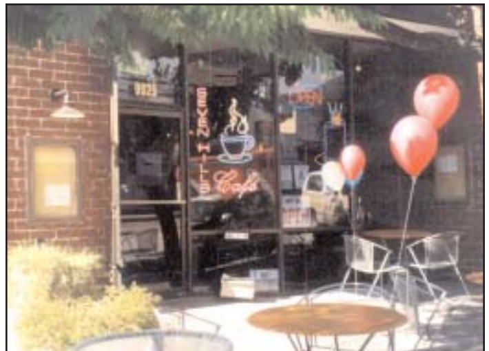
9925 Commerce - Sevenhills Café