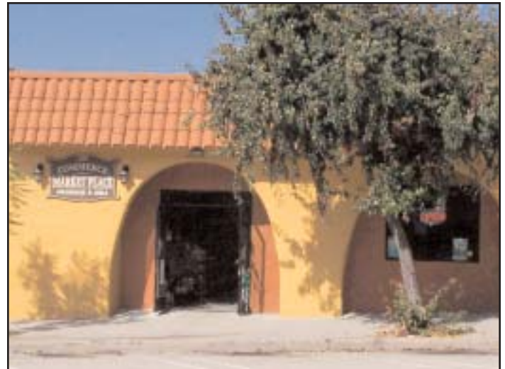
10047 Commerce – Commerce Market Place