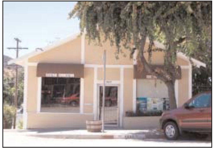
9937 Commerce – Electric Connection (formerly AdMart)